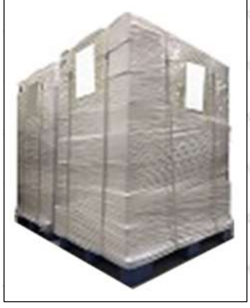
Pic No. 4

Pallet Shipping: Use pallet that meet export requirements, and use white wrapping protective film to wrap and bind with cable ties