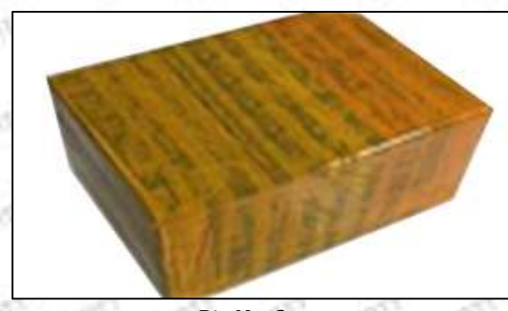
Pic No. 3 International express packaging: Wrapped with yellow tape after wrapping