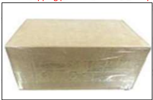
Pic No. 2 Domestic express packaging: Wrapped by Transparent tape black protective film

▲ Minors are prohibited from using transparent tape, yellow tape, black wrapping protective film, and white wrapping protective film to avoid personal injury.